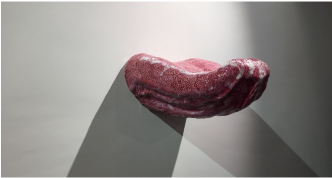
CANIS LINGUA 2